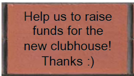
A double brick with 4 lines of text.