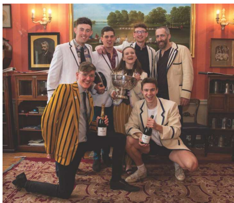
Members of men's eight with the 2019 Jackson Trophy

You can follow the Club on Twitter @Tyne_Rowing, Facebook @TyneARC and on the clubs website at www.tynerowingclub.org